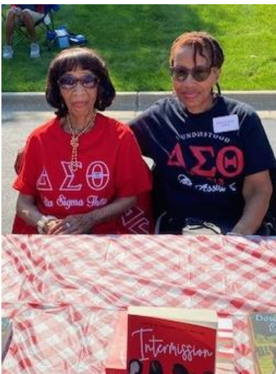
With my mom at Delta literacy event in Schaumburg, IL.