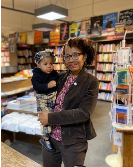
Homecoming at Boswell Book Company in Milwaukee. Also pic with my cutest reader (grandbaby!).