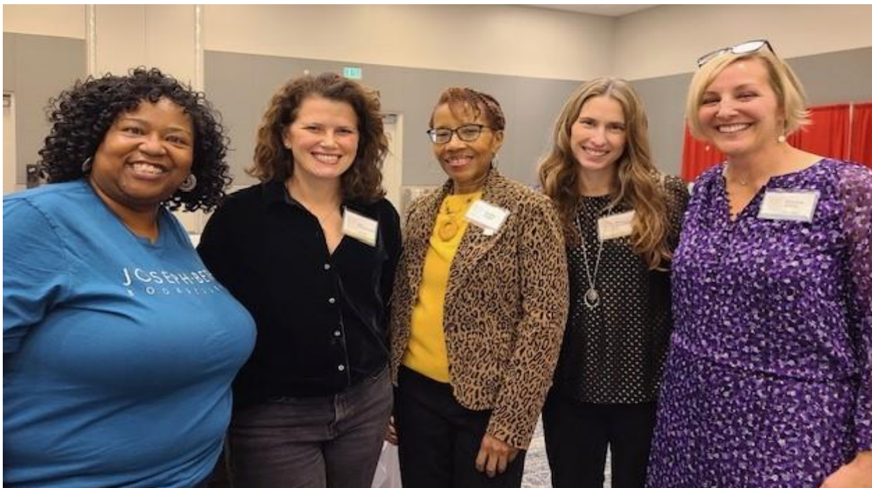
On a panel with these authors at Books by the Bank, bFook festival in Cincinnati.