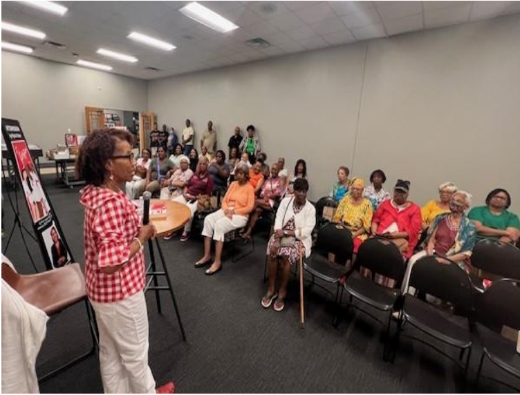
July 25 book launch in Memphis at Novel.