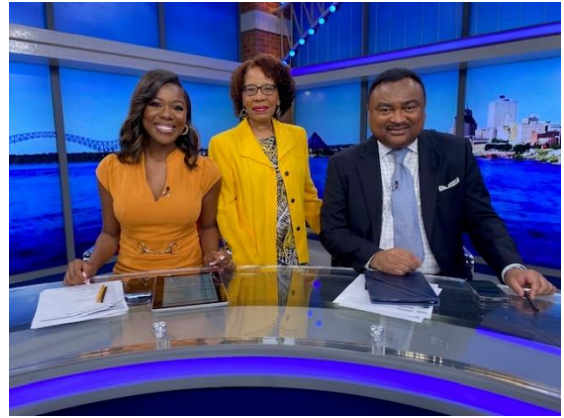
Interview on Channel 3 – Live at 9