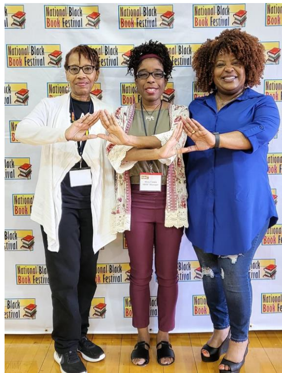
National Black Book Festival in Houston