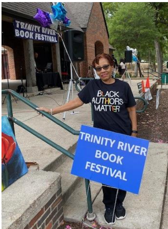
Trinity River Book Festival in Fort Worth