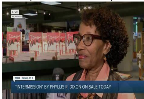
Made the news! TMJ Channel 4